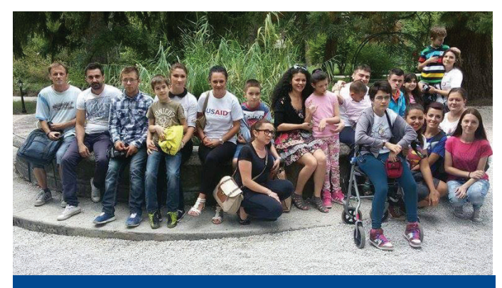
The Center's users during an outdoor activity

The Association "Dajte nam šansu" from Sarajevo and the Children's Educational Center "Svjetlice", which was opened in September 2015 in Banja Luka, are continuing with their successful activities. The Service Centers have thus far provided a total of 5478 services, of which 3492 were provided in Sarajevo and 1986 in Banja Luka. Activities and services offered by the Service Centers to their users are: short break, outdoor activities, individual and group work led by a special needs education expert or a psychologist, transportation services for children and parents, providing information, psychological support for parents, observations of children with suspected disabilities, mobile team, help during crises, workshops for siblings, help in hiring in-class assistants and