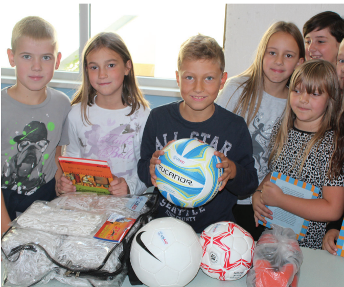
Elementary School Glamoč students with PE equipment

The listed equipment significantly improved the quality of performing classes in Glamoč for over 400 elementary and high school students.