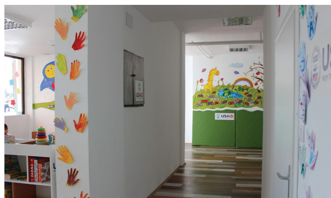
Newly opened Service Center before the opening ceremony