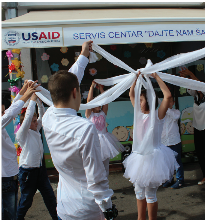
Performance of the Center users for the grand opening

Almost 30,000 children with developmental disabilities in BiH receive support exclusively from their own families, from individual institutions or through sporadic education. A child or a person with developmental disabilities in BiH rarely has the opportunity for education, inclusion and equal participation in the society. By opening the second Service Center “Give Us a Chance” in BiH, these facts are gradually becoming a thing of the past. Inclusion is not a manner to involve these persons into the processes in their communities, but a manner to adjust these communities primarily to them and also to their families through adequate programs, support and activities.